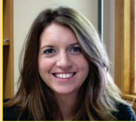
Verity Kislingbury Program Support